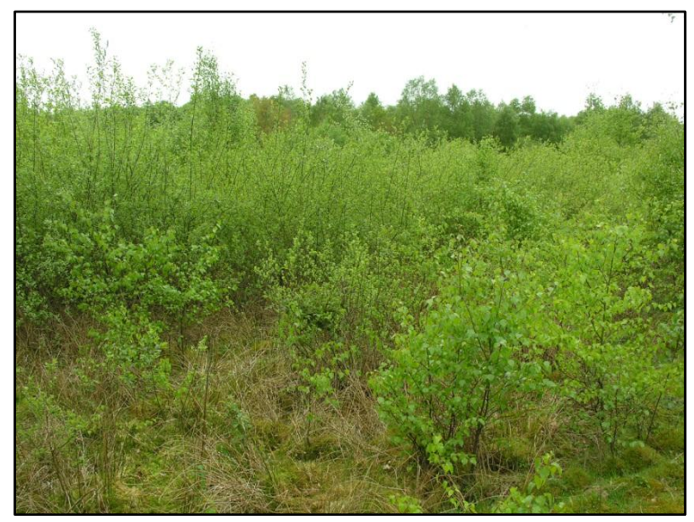
A 'heathland' reserve in Cheshire.

Lack of management has to be addressed at nature reserves; heathland continuity is crucial in Adder conservation terms; the feast or famine management regime which goes from scrub saturation to scrub clearance degrades the habitat.